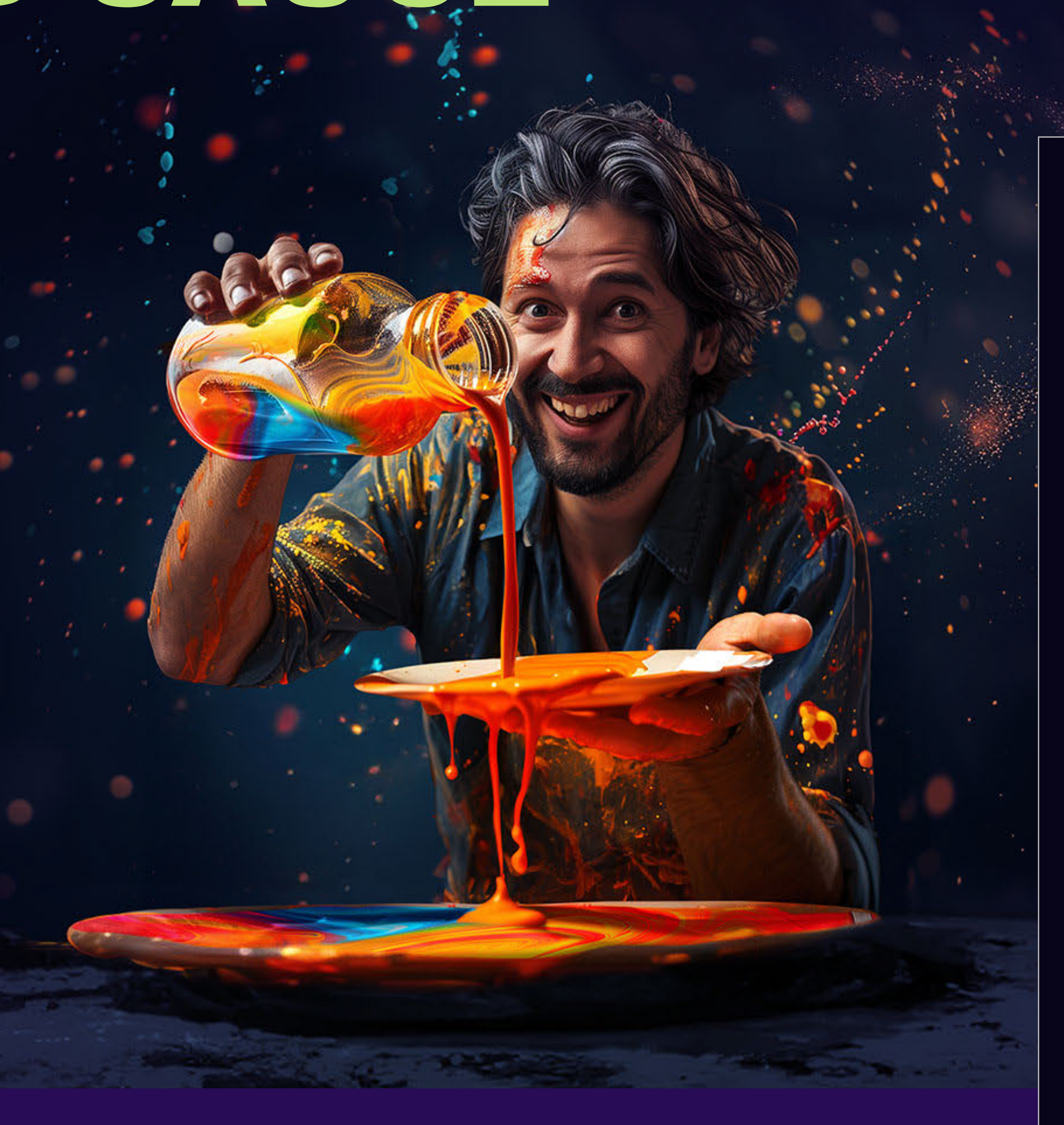
Our core services divided by 4 key areas; Product, Community, Adherence and Wellbeing: